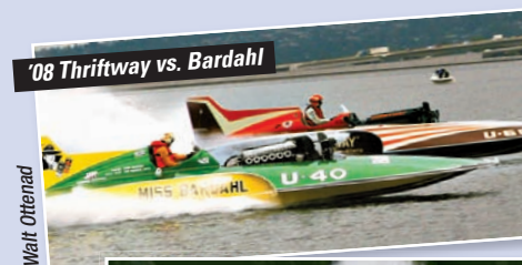
08 Thriftway vs. Bardahl