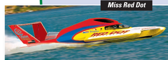
Miss Red Dot

All times subject to weather, cranes, accidents, boat towing & Acts of God.