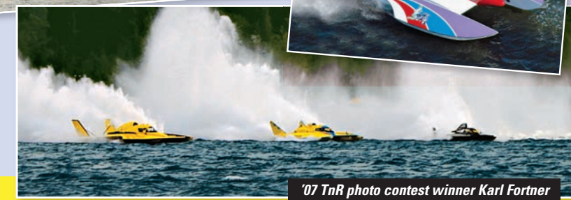
'07 TnR photo contest winner Karl Fortner