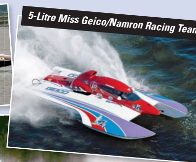
5-Litre Miss Geico/Namron Racing Team